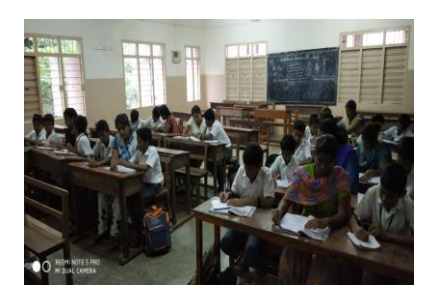
COACHING CLASS FOR DON BOSCO SCHOOL STUDENTS